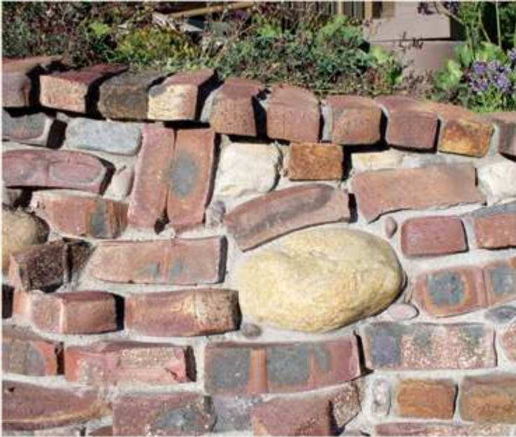
Extreme Radical Clinkers Dana Point, CA

A clinker brick is one which was discarded because it was discolored or distorted. In the 1920s, leaders of the Arts and Crafts design movement rediscovered its possibilities for creative and dramatic architectural detailing. The clinker brick's eccentric, irregular shapes and colors appealed to the Arts and Crafts aesthetic which was to rebel against the takeover of soulless, machine-made uniformity.