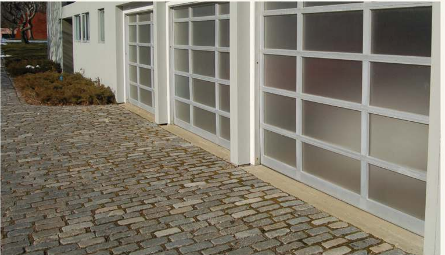
Lake Street Cobblestones, Amagansett, NY