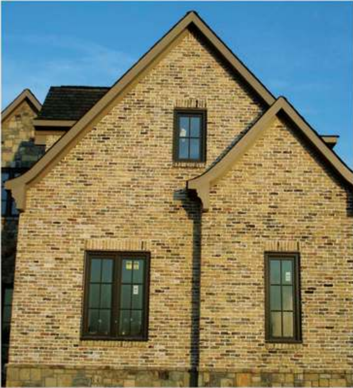
Antique Buff Handmade Bricks Los Angeles, CA