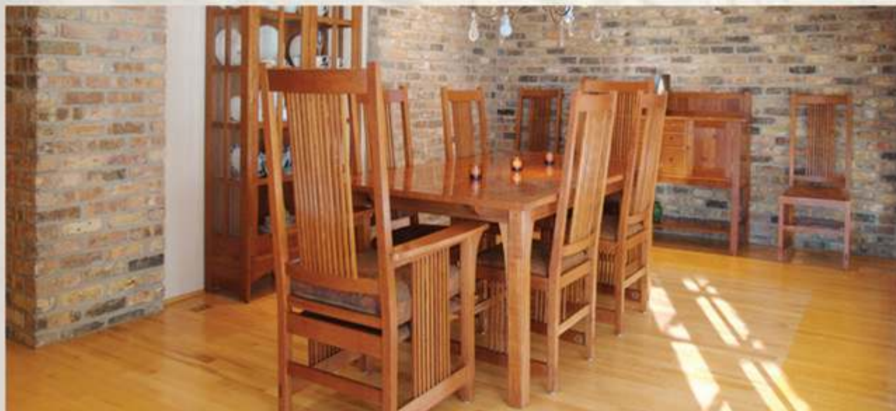
Brick Veneer, San Francisco, CA

Brick veneer combines the character and durability of real brick with the installation convenience of tile. Genuine vintage building bricks are salvaged from demolition sites in Chicago, then sliced into 1/2" thick tiles which are infinitely adaptable for interior or exterior projects.