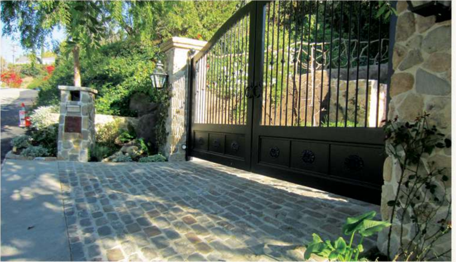
Bluestone Cobblestones, Los Angeles, CA