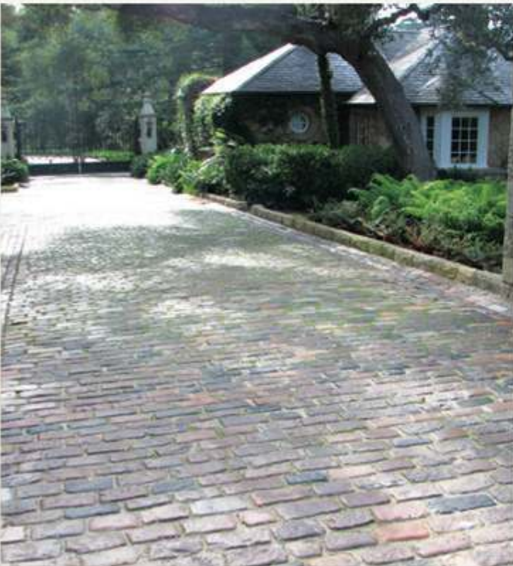
European Blend Cobblestones Montecito, CA