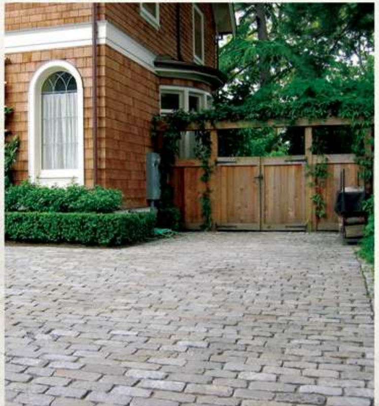
Salt & Pepper Cobblestones Franklin, TN