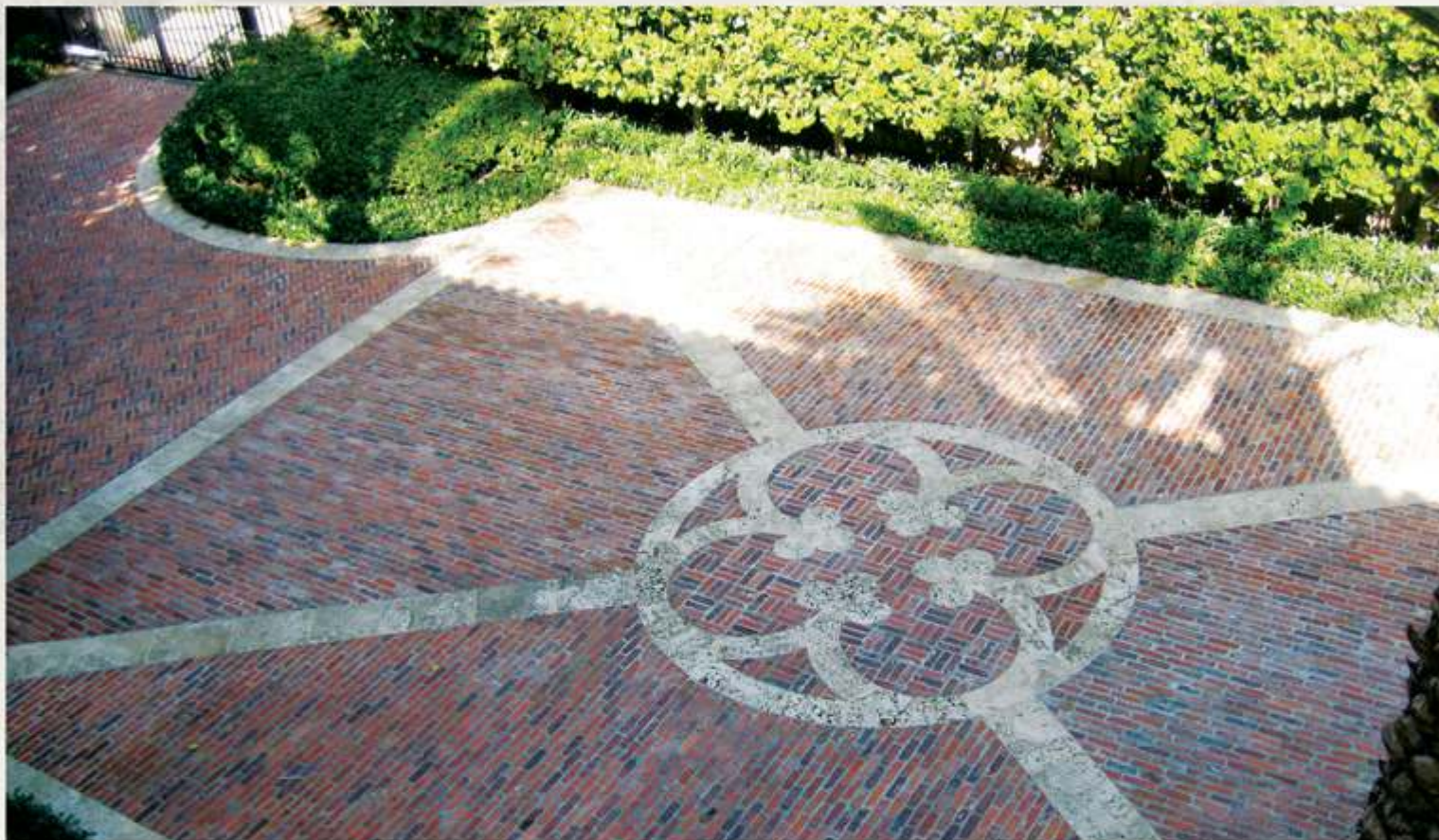
Old Madrid Pavers, West Palm Beach, FL

Salvaged from historic buildings across the U.S.A., this collection can be used for exterior applications in warmer climates. (For cold climates, we recommend brick street pavers or granite cobblestones.) These common pavers are easily adaptable for driveways, patios, garden paths and more, resulting in a mellow, natural look as well as strength that will last for generations.