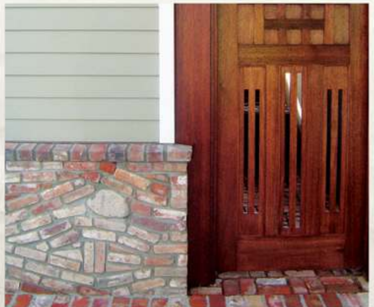
Old Tuscan Clinkers Newport Beach, CA