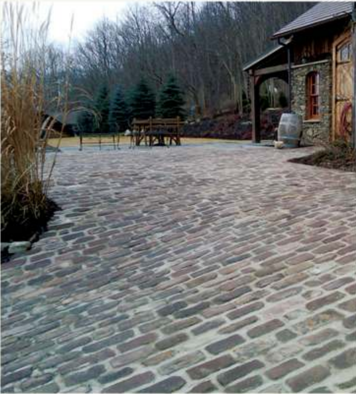
Old English Cobblestones Fingerlakes Region, NY