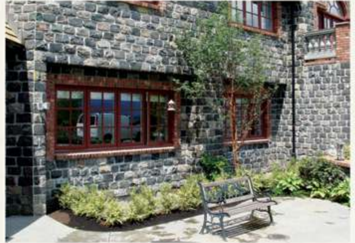
Old English Cobblestone Veneer Toronto, Ontario, Canada