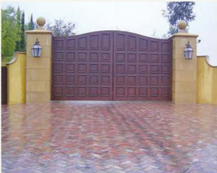
Old Tuscany Pavers Beverly Hills, CA