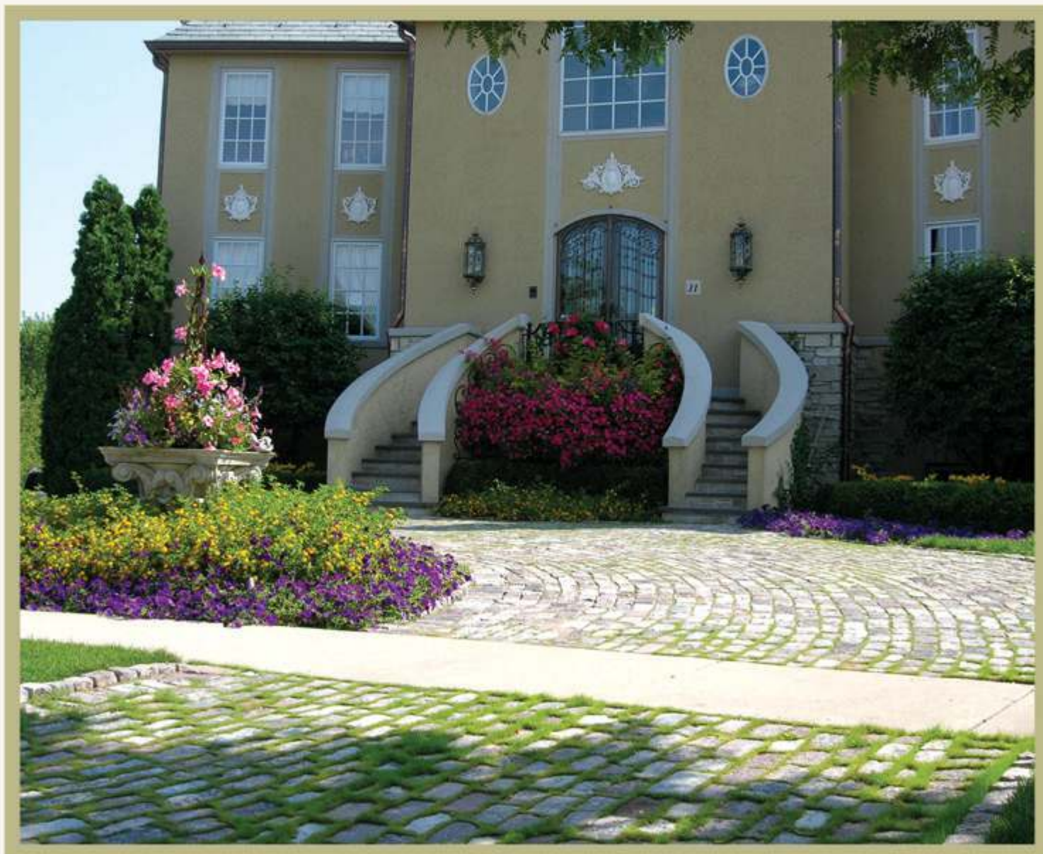
European Blend Cobblestones, Lake Forest, IL

Some came from Europe as ship's ballast; others were quarried locally. Then they were incorporated into the streets of some of America's most historic cities, 150 to 200 years ago. Antique cobblestones come in random lengths of 6" to 12" to produce the characteristic Old World cobblestone look for your own driveway. Our stone is sold by the square foot and can be shipped nationwide.