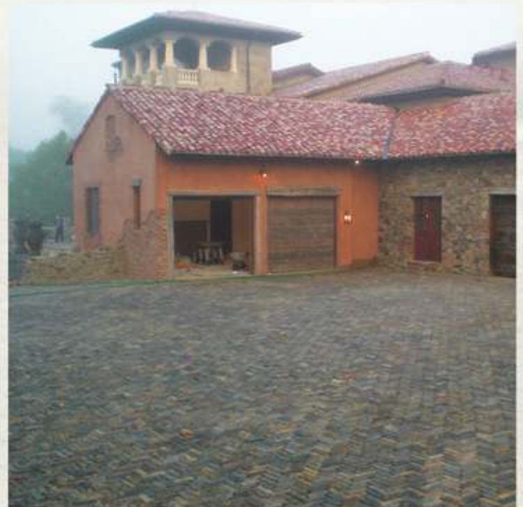
Frank Lloyd Wright Street Pavers Potomac, MD