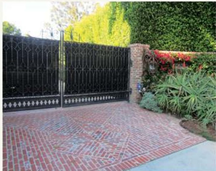
Antique Mixed Red Pavers Santa Monica, CA