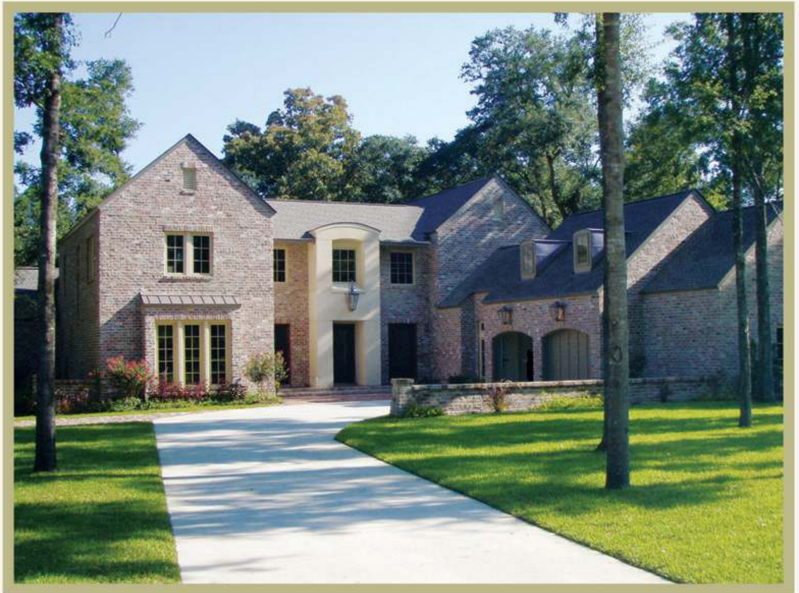
Old Tuscany Bricks, Birmingham, AL

Today's new bricks cannot match the colors, textures and character of our genuine antique bricks salvaged from buildings in Ohio, Illinois, Wisconsin, Iowa and more. They will perform well in any interior, as well as landscape features (such as walks and patios) in Southern climates. Shown are just a few of the colors and sizes available for you to choose from in the nation's largest selection of common bricks.