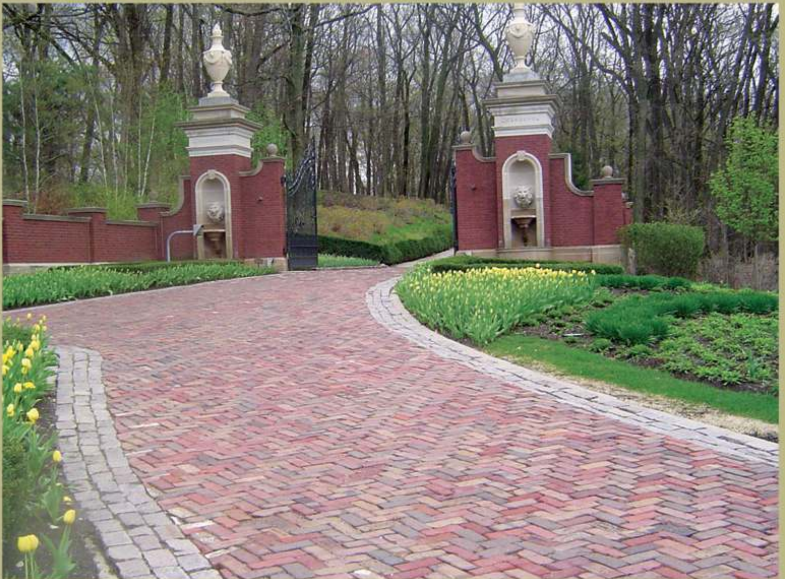
Antique Purington Street Pavers, Lake Geneva, WI

Reclaimed from streets, sidewalks and other paved areas of bygone centuries, our genuine antique brick pavers let you literally walk in the footsteps of America's forefathers. Our collection includes street pavers that have endured extreme abuse, and will continue to do so for generations to come...common pavers suitable for southern climates...sidewalk pavers perfect for today's garden paths and walkways...and even flooring tile cut from real vintage bricks.