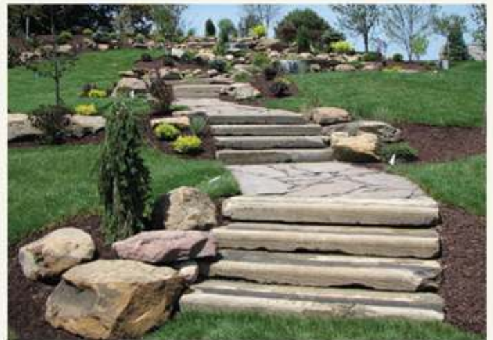
Sandstone Curbing Shaker Heights, OH