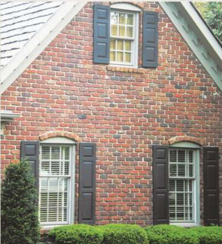
Antique Metropolitan Pavers Glen Elyn, IL