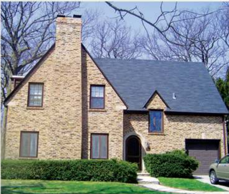
Tudor Clinkers Lake Forest, IL