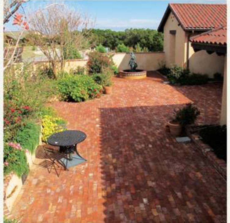
Antique Purington Flat Street Pavers Fort Worth, TX