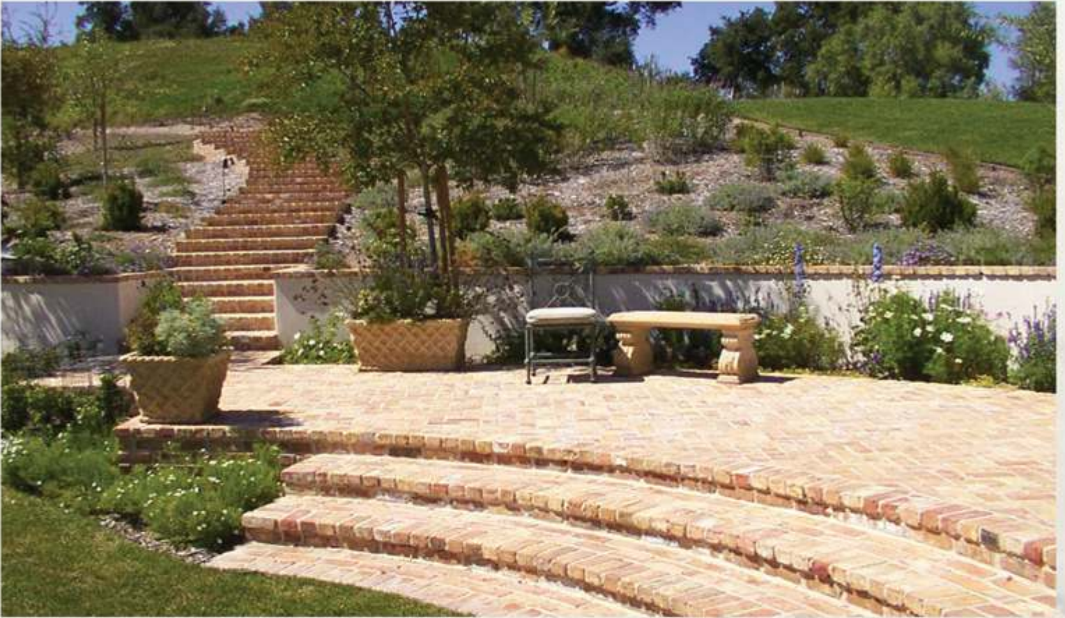
Old Depot Pavers, Palm Desert, CA