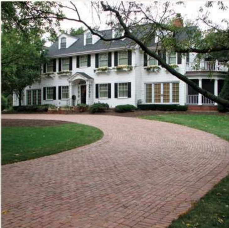
Antique Barr Street Pavers Hinsdale, IL