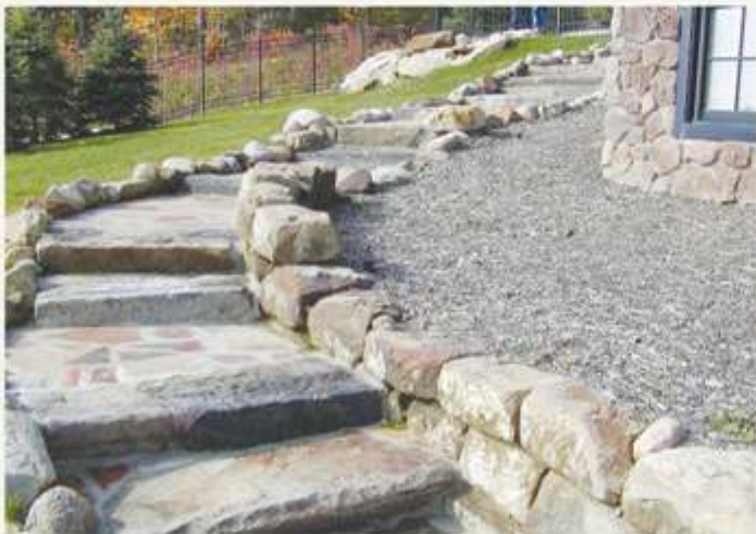
Granite Curbing Philadelphia, PA

Their traditional purpose of edging streets and walkways is just the beginning of the design possibilities for these vintage curbing stones. Stone curbing can also be laid flat for paving/patios, steps, benches, fireplaces and more. Using stone curbing is another way to incorporate reclaimed materials into your unique and stylish environment.