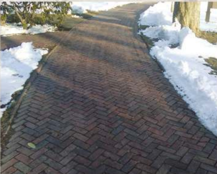
Colonial Red Sidewalk Pavers Washington, DC

Recapture the charm of historic Midwestern towns for your own property with bricks salvaged from actual 100-year-old sidewalks. Brick sidewalk pavers make beautiful and unique walkways and patios that exude the character of the past, while offering exceptional longevity into the future.