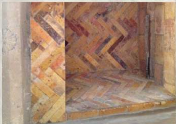
Antique Firebrick Santa Barbara, CA

Working on a historical restoration or addition? We'll match the existing brick of your building from our sources of authentic reclaimed materials, or we will duplicate it in original coal fired beehive kilns.