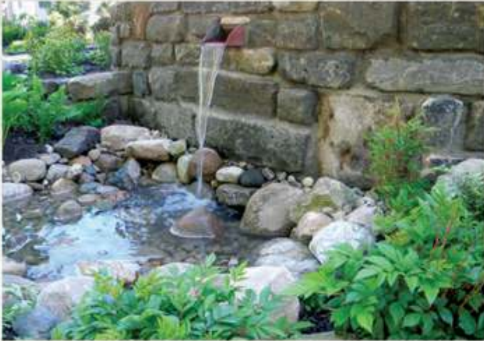
Reclaimed Baldwin Wall Stone Madison, WI

We are proud to be the authorized salvagers of Berea sandstone blocks from the grounds of the historic Baldwin Reservoir in Cleveland, OH. Antique wall stone is ideal for garden walls, retaining walls and many other projects. Our reclaimed cobblestone also makes for stunning veneer stone.