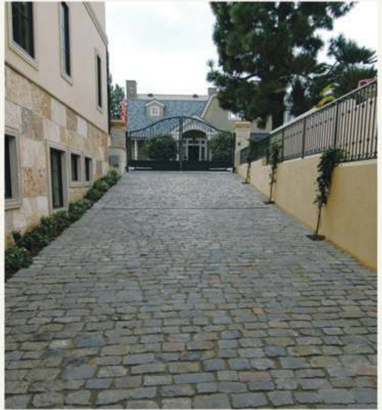
Lake Street Cobblestones Orange County, CA