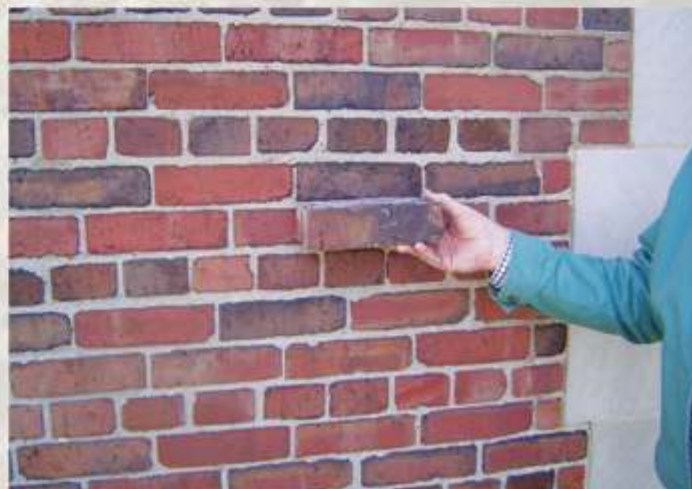
Antique Brick Matching Lake Forest, IL