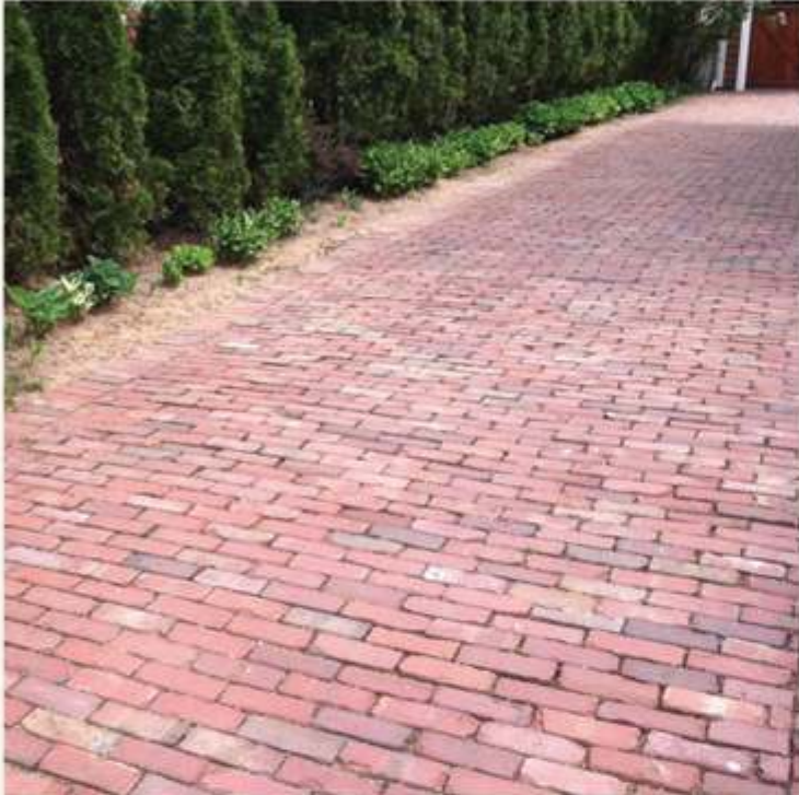
Antique Metropolitan Street Pavers Lambertville, NJ

Made to withstand centuries of heavy traffic, these vintage bricks are reclaimed from quaint old streets throughout the Midwest. Our street pavers are still in superb condition, with a durability and charm unmatched today. Antique street pavers will not fade as modern concrete pavers do. Choose from America's largest selection to create your one-of-a-kind driveway, patio or walkway.