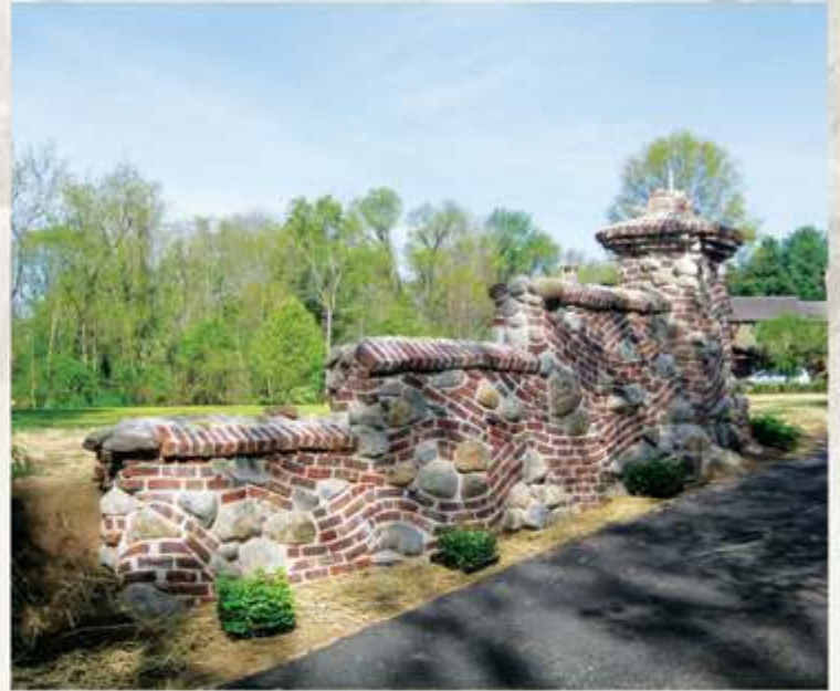
Old Pasadena Clinkers New Hope, PA