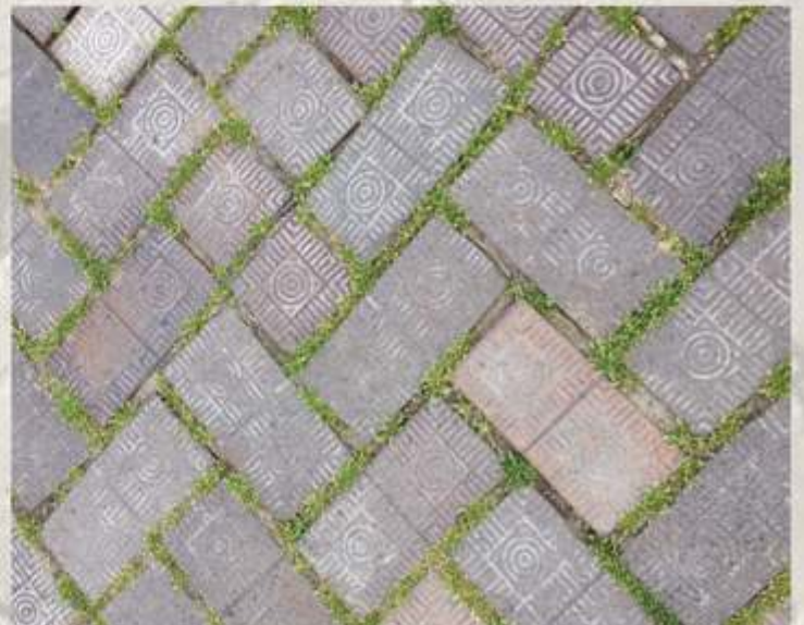
Art Deco Sidewalk Pavers Asheville, NC